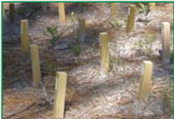
Proven Reliable in Field Testing.