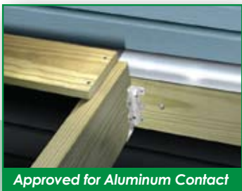
Approved for Aluminum Contact