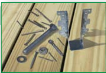
Better Corrosion Protection

For more information visit www.osmosewood.com